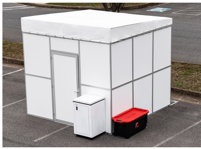
Unit with Optional Counter