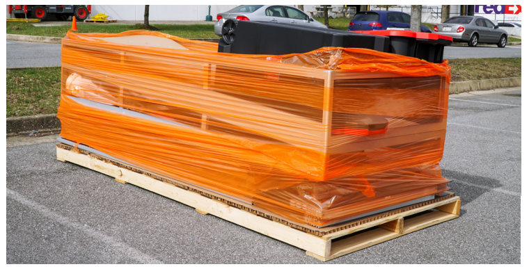
Ships on One Skid for Easy Logistics