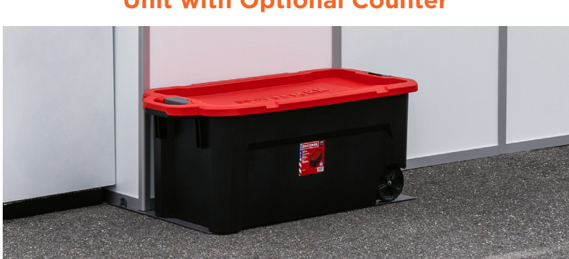
Exterior Ballasts to Secure Unit