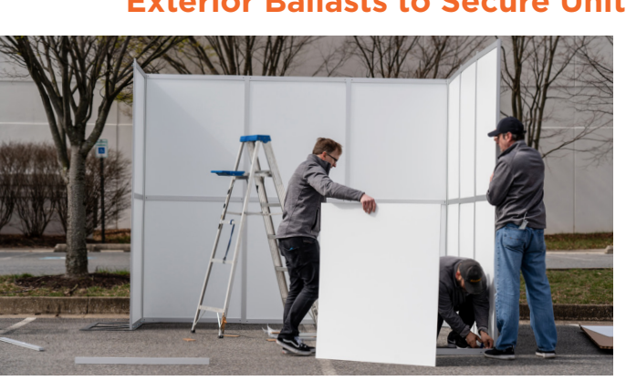
Sets up with One Tool