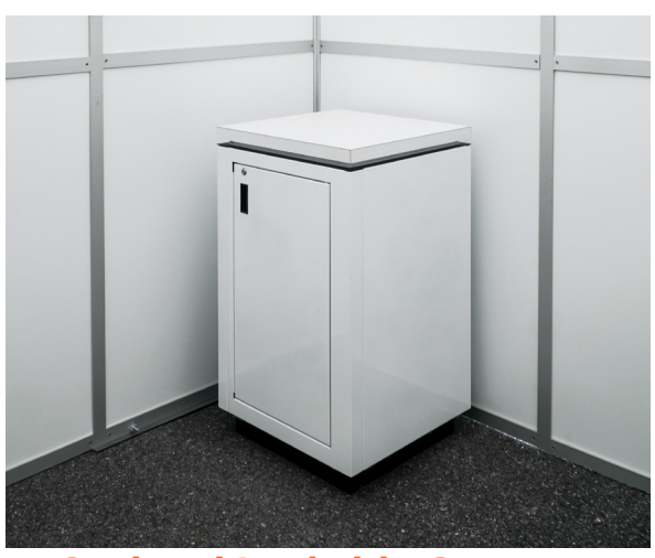
Optional Lockable Counters